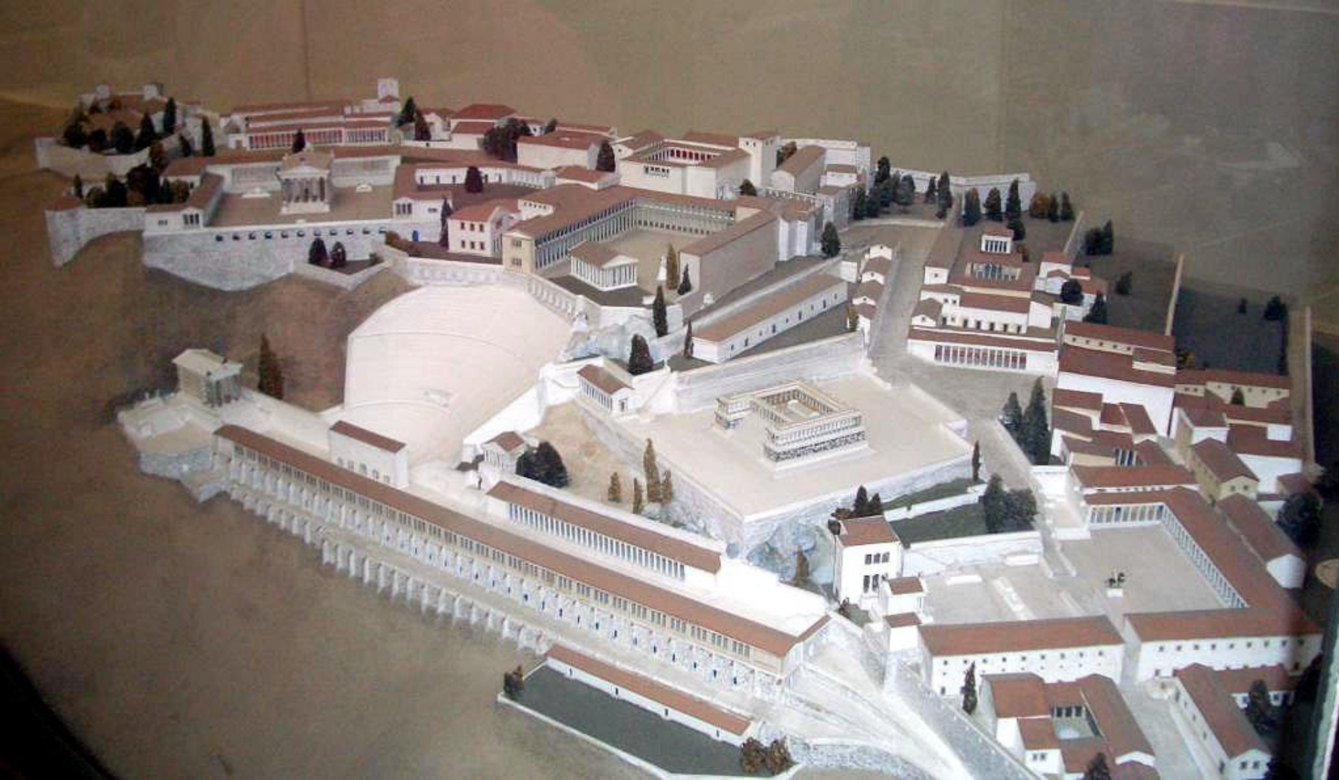
City Model in Pergamon Museum, Berlin